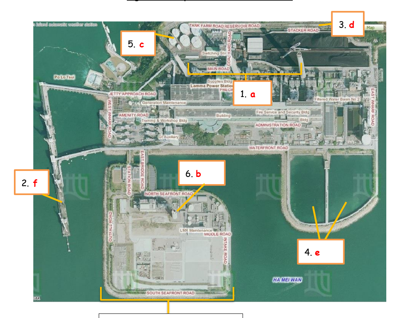
Figure 1 Components of Power Station